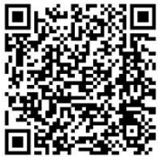
↑ QR code

東北大学授業料口座振替申込ページ Tohoku University Automatic Tuition Fee Payment Registration Page